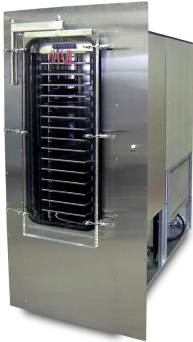
(Cleanroom configuration 50L Ultra EL shown)